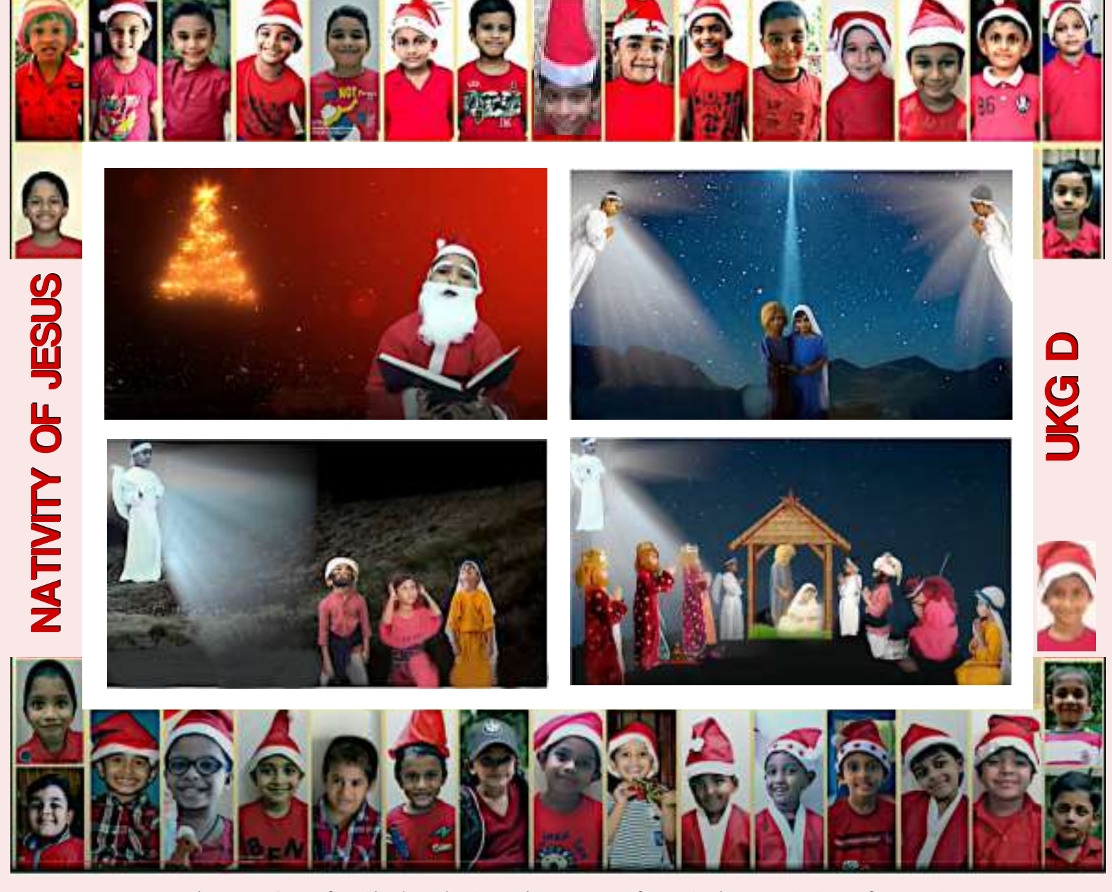
The UKG D family bordering the scenes from 'The Nativity of Jesus'

people behind it. The online celebrations being so sweet, we can imagine how sweeter they would have been had they been of the tradition sort on the campus. Let us hope for the best and welcome the New Year with courage and look forward to next year's celebrations and a gala time in our auditorium, watching the special programmes onstage, talking, and sharing jokes and gifts with the ones who mean a lot to us.